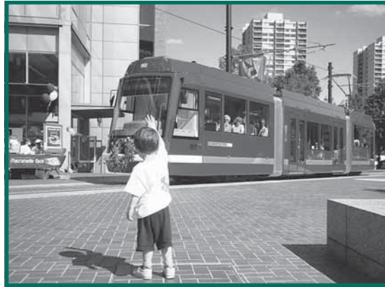
Streetcar at Portland State University.

Before beginning construction, project partners are hosting four "Streetcar Chats" to provide an opportunity for people who live, work or own businesses or property along or near the loop extension to talk directly with the project designers. The Chats will be hosted in the Lloyd District, Central Eastside, The Pearl and Oregon Museum of Science and Industry. For more information, see the back page!